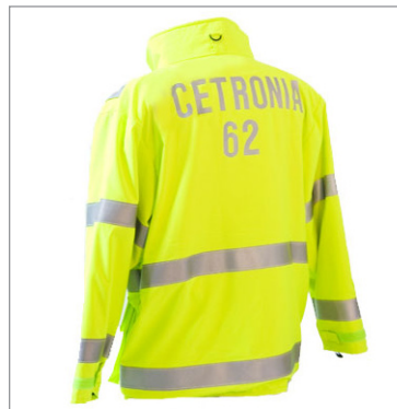
Back with Sample Lettering