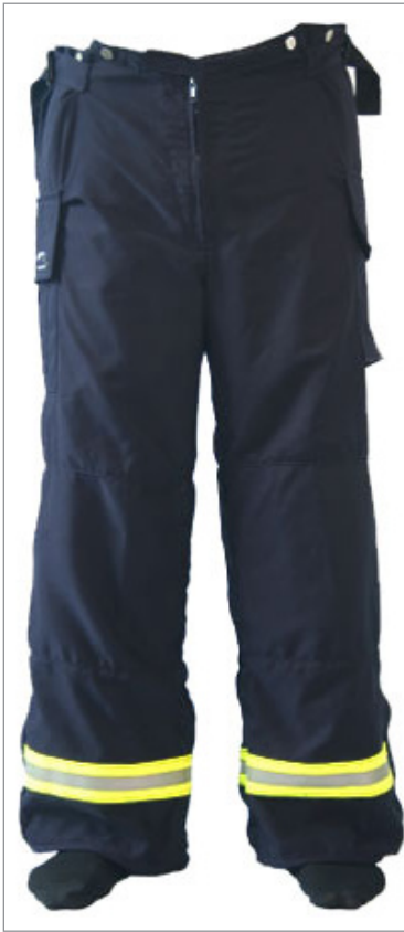
Front with Fully-Gusseted Fly and Self Material Knee Reinforcement