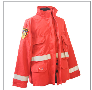
Non-Hi-Viz Option, Red