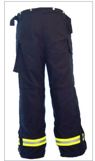
Back with Suspender Buttons and Adjustable Waist