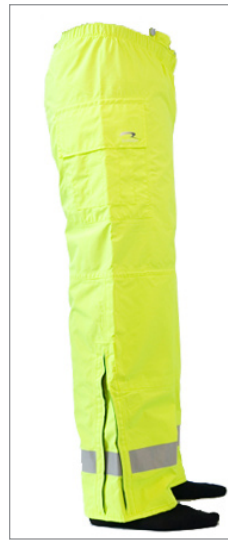
ANSI-107 Certified High-Visibility Option