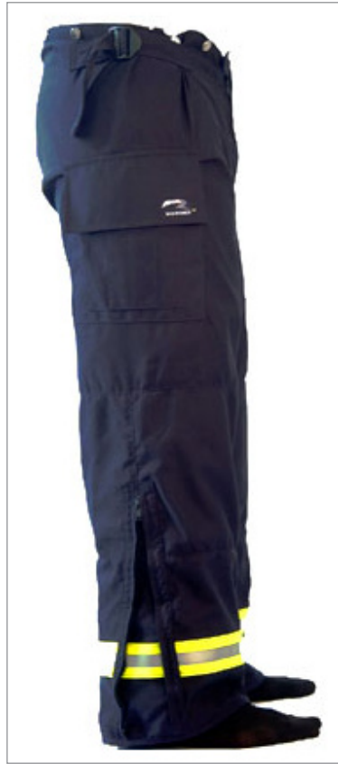
Side with EMT Pocket. Zipper Expander with Continuous Reflective Trim